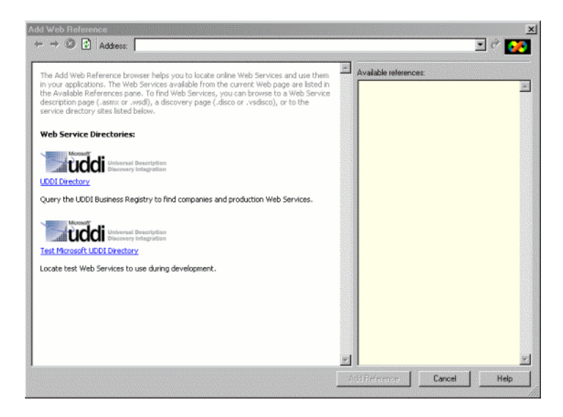
Figure 1: Browsing For a Web Reference in Visual Studio