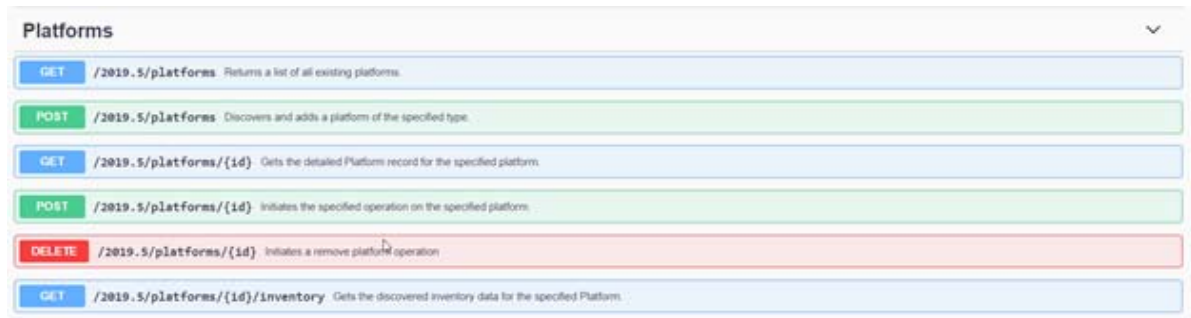
Figure 2-2 Methods of Interaction Allowed for Platforms Resources

To learn more about how to navigate the API reference to understand the resources, methods, operations, and relationships, continue with Section 2.3, “Exploring Migrate Resources,” on page 13.