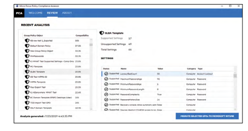
Figure 2. Cloud-readiness Assessement

As Microsoft releases new updates, completing the assessment and migration manually with scripts can be a daunting task. There are also reports that need to be created, so you can see what percentage of your policies are not yet migrated. Not having to maintain reports in spreadsheets can be helpful during audits or when reporting to management.