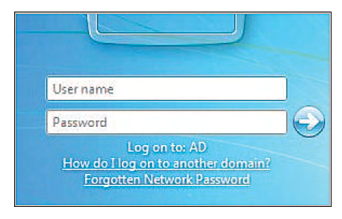
Figure 2. NetlQ Self Service Password Reset integrates with the Windows login screen to allow users to reset forgotten passwords.

Audit logs. NetlQ Self Service Password Reset audits event logs for security and troubleshooting purposes, including user activities and system events. It also forwards audit events to syslog and compatible servers.