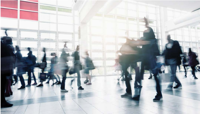
Figure 1. Regulation and complexity

exchange must be identified, analyzed and protected to reduce risk of loss or theft.