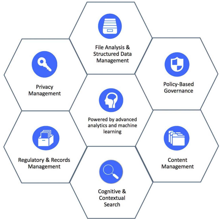
Figure 2. The Micro Focus SCM Suite powered by advanced analytics and machine learning

to positive differentiation and value creation is critical but so too is understanding the huge benefits organizations can receive from having deep insight into their information. Powered by advanced analytics and machine learning the Micro Focus SCM Suite provides actionable insights that powers efficiency and control.