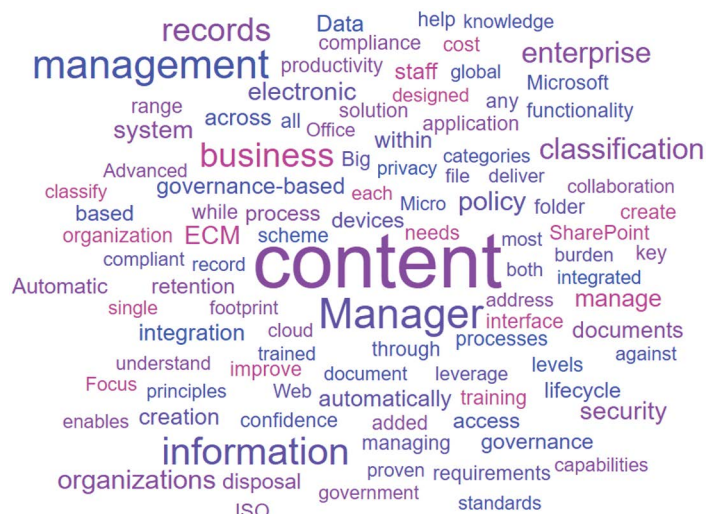
Figure 2. Content Manager covers a broad range of functional requirements

It does not always make sense to move critical content and records into a central repository, there are times when the content is best left in the authoring application where it offers the most value. Content Manager uses a manage-in-place framework to apply holds to content in external repositories without the need to migrate it to a central repository. The latest Content Manager release includes full integration and collaboration with Microsoft's 365 and OneDrive technology, further broadening the product's comprehensive content oversight. With such comprehensive storage and classification on offer, it also holds that there will be a variety of reporting requirements. Application Integration APIs provide organizations access to their data in a standards-based and secure way