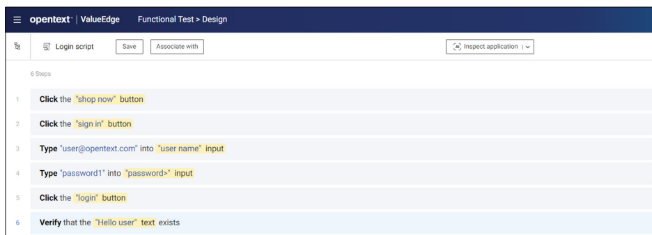
Figure 1. ValueEdge Design Dashboard