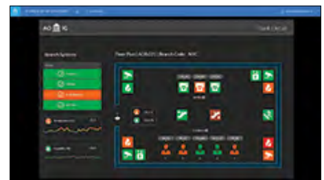
Figure 1. The BVD can be completely customized to meet the needs of your organization.