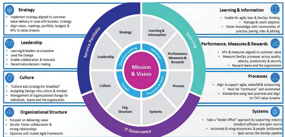
Figure 1. OpenText DevOps Operating Model