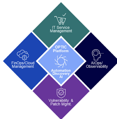
Figure 2. OpenText IT Operations Management solutions support ESG initiatives.

With our products, we aim to assist in controlling GHG emissions by releasing features that help organizations track and reduce