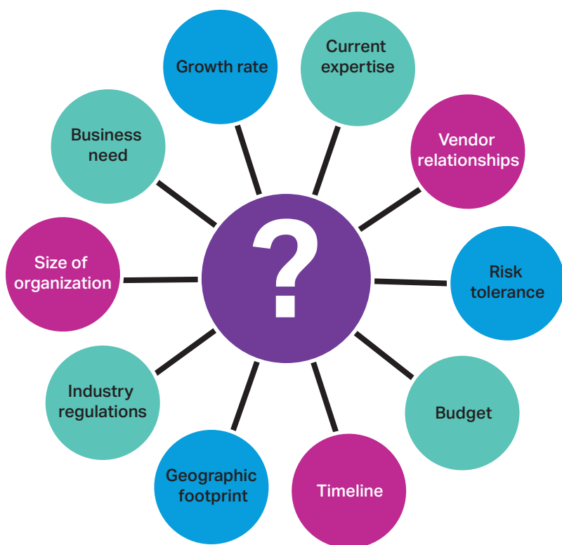
Figure 1. Considerations of security operations implementation and monitoring

A common question for organizations is whether they should invest in standing up their own internal SOC or outsource their security operations. Both options have benefits and the best direction will be determined by the needs of an organization. The first step is for the organization to define the business need and expectations of the SOC function. This will guide the decision. Additional questions to raise are “What is the size and geographic footprint of your organization?”, “What is your risk tolerance towards breaches?”, “How quickly is your organization expanding?”, and “What is your budget?”