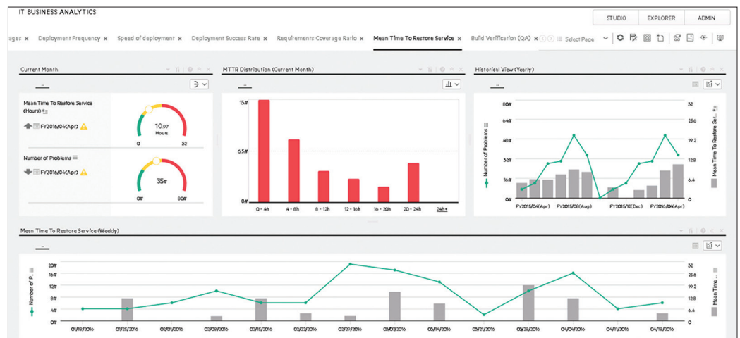
Figure 2. An example of a Micro Focus solution dashboard

The innovation in Micro Focus solutions provides a single view into DevOps metrics, helping you gain insights into your DevOps journey so you can effectively manage your DevOps transformation.