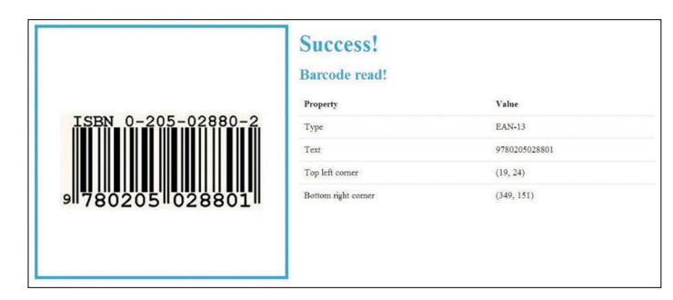
Figure 6. Visual Server is able to detect and read barcodes