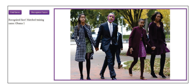
Figure 2. Face recognition

In addition to finding faces, Visual Server and its facial recognition features can also compare the detected face to a database of known individuals. The matching threshold can be adjusted to suit different needs. Visual Server face recognition technology is comparable to other leading face recognition vendors.