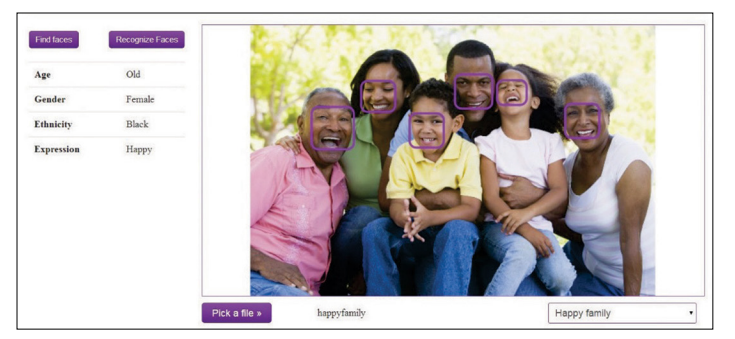
Figure 1. Face detection and analysis

Face detection finds faces in a given image. Visual Server returns the coordinates of a detected face in a photo, as well as the position of key facial features such as the eyes.