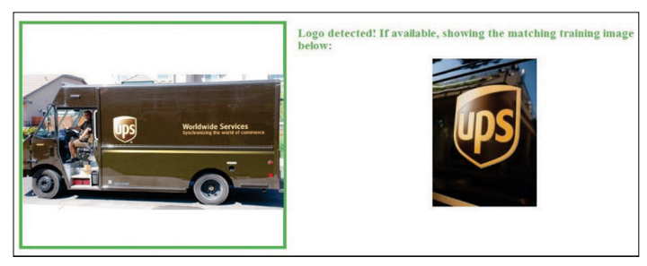
Figure 3. Logo and object recognition

Visual Server can be trained to recognize specific objects or complex patterns in analyzed images. For example, a user can train a database of corporate logos to combat copyright infringement. When a picture is analyzed, Visual Server can report if it has found any matching logos from its training set. The objects can be 2D or 3D objects in images.