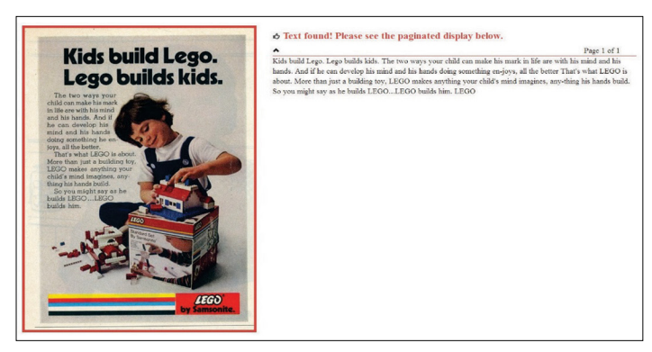
Figure 5. Text is captured from an advertisement using OCR

Optical character recognition is used to extract text from image files. The use of OCR on scanned or photographed documents, pictures, or photos facilitates the conversion into a computer-readable format to make it easier to store and search the documents. Given an input image, Visual Server can return the identified text, the confidence score, and the region of the image the text was read from. The detection region can be bound to certain areas to decrease noise from the rest of the image and accuracy can be fine-tuned to the position of each character. Visual Server supports all major languages and font types for OCR. A full list of languages and fonts are available in Appendices A and B.