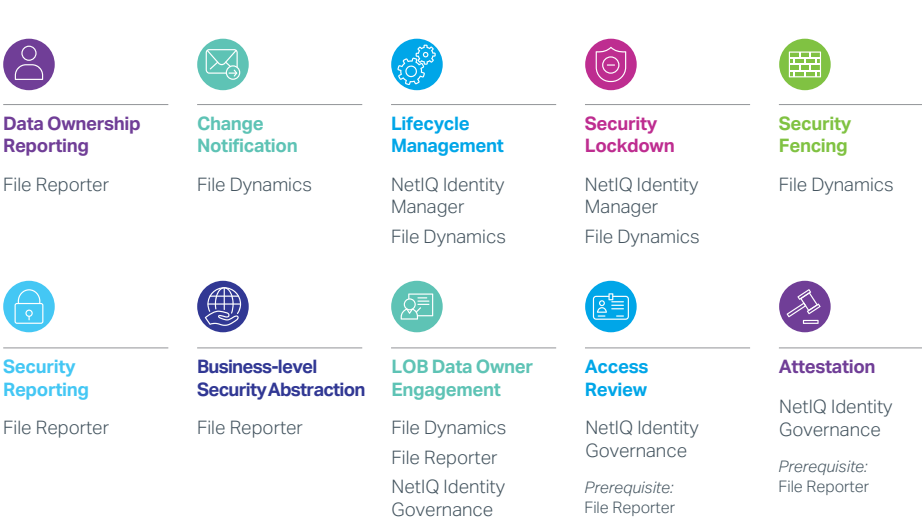
Figure 1. Product map for NetIQ DAG market solution.

Many organizations must comply with security regulations that require vigilance in user access to areas of the network containing personal data or other restricted or sensitive information, so being notified of any changes to access permissions can be critical. Security Notification policies let you specify the shares or folders to be analyzed, the frequency of this analysis through scheduled scans, and the data owners who are to be notified when changes in access permissions take place.