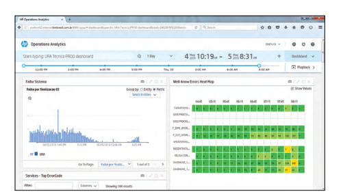
Figure 1. Number of internal errors

Using Operations Bridge Analytics to continuously monitor the health of their IVR system, TIM Brazil was able to reduce the number of misrouted calls by 40%. Understanding and optimizing the performance of IT infrastructure enabled TIM Brazil to enhance its newcustomer onboarding experience as well. This resulted in a positive impact on customer loyalty and market share.